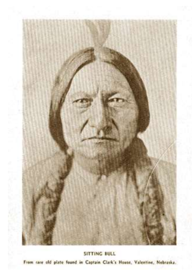
Chapter 4 - THE CUSTER FIGHT

Sitting Bull - From rare old plate found in Captain Clark's House, Valentine, Nebraska