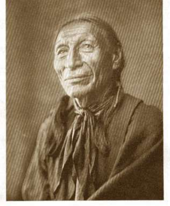
IRON TAIL. The celebrated Chief whose head is on the United States nickle, at age of 64. The man of whose Buffale Bill said to the author: "He is the finest man I know, bar none,"

Iron Tail - The celebrated Chief whose head is on the United States nickle, at age of 64. The man of whom Buffalo Bill said to the author: "He is the finest man I know, bar none."