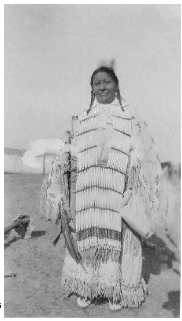
A Sioux squaw in full dance dress

As the sun went down in dark clouds fringed with orange and gold, and the twilight cast long shadows from the rugged western hills, the strange scene gradually faded and darkness spread over it all. Flash lights and torches appeared and camp-fires were showing all around, like myriad fire-flies flitting about in the gloom. A faint roar like the hum of a distant cataract could be heard, broken by the shouts of the herder-boys as they made their nightly round-up. Here and there could be heard the tom-tom and uncanny war-songs of the weird dances and feasts being held in various sections of the great encampment.