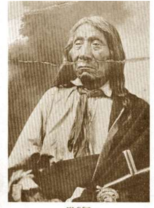
RED CLOUD Taken about 1905 by Fefix, see of the Chief Flying Hawk, showing Pipe and Peach sent to the author. Rare picture of the famous old chief taken shortly before his death.

Taken about 1905 by Felix, son of the Chief Flying Hawk, showing Pipe and Pouch sent to the author. Rare picture of the famous old chief taken shortly before his death.